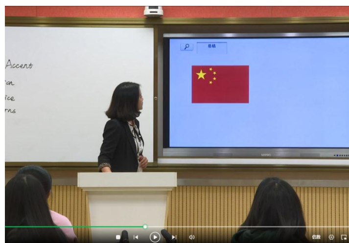
图 3 课堂中的思政教育