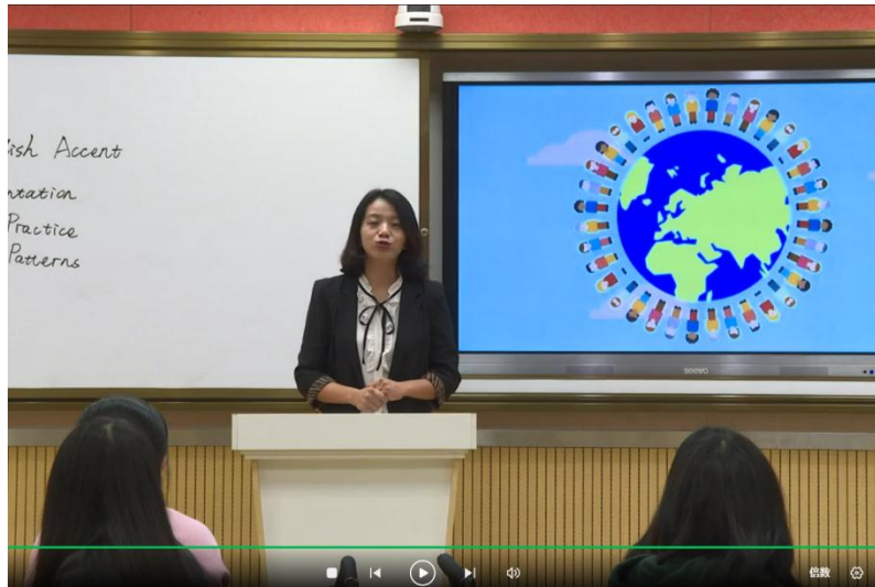
图 4 课堂中的思政教育